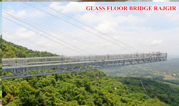
GLASS FLOOR BRIDGE RAJGIR