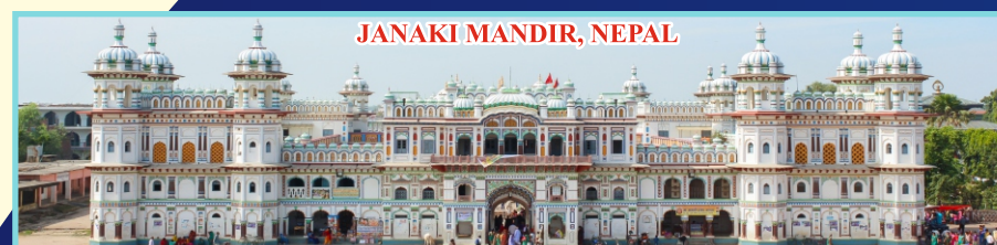
JANAKI MANDIR, NEPAL