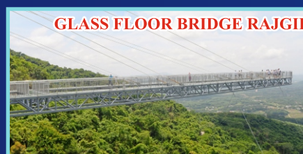
GLASS FLOOR BRIDGE RAJGIR